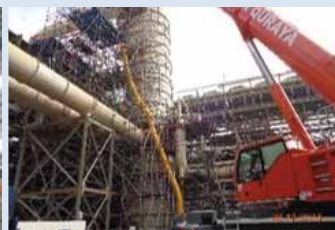
Erection of Chute for Unloading of Packings in Wash Water Column