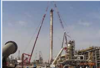
Flare Tip Replacement Work