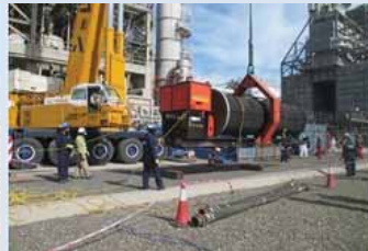
Heat Exchanger Bundle Pulling - Aerial Bundle Puller