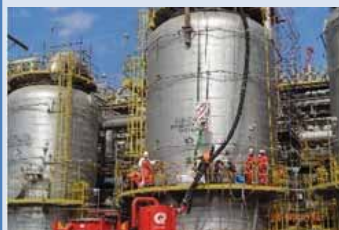
Unloading & Loading of Catalyst in the Reactor