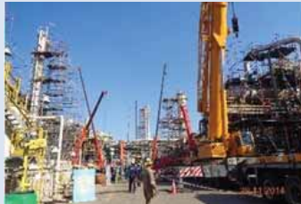
Various Critical Lifting Works In Progress during Peak Days of Shutdown