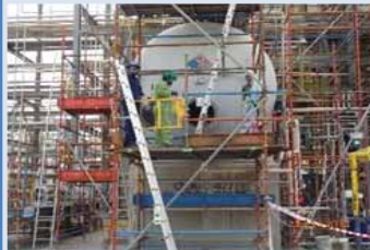
Confined Space Entry Works at a Knock Out Drum