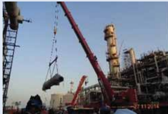
Replacement of Heat Exchanger with High Capacity Cranes