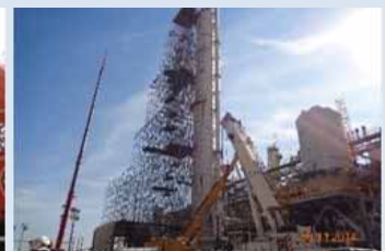
Massive Scaffolding Erected to carryout Maintenance Activities in Column